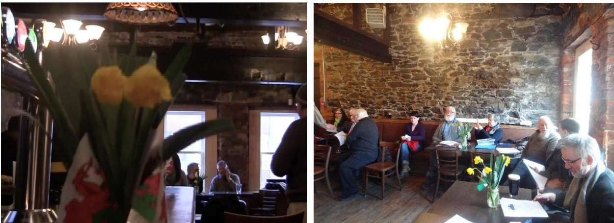
AGM attendees at O'Reilley's on St. David's Day